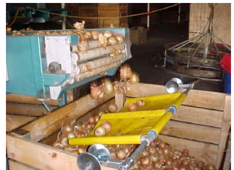
NoFol economy bin filler