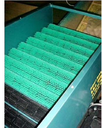
Dry Brusher to polish and remove loose skins.